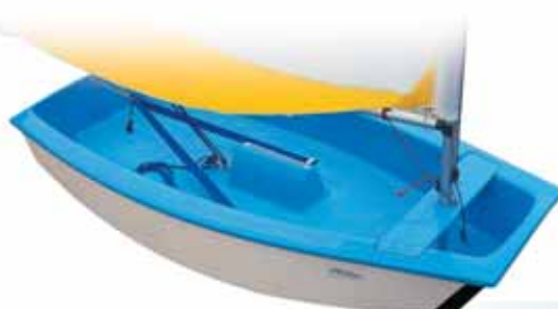
Self-draining accommodating cockpit Transom bow protected by bumpers.

Hull weight : 39 kg Length : 2,33 m Width : 1,13 m Sail area : 3,60 m 2